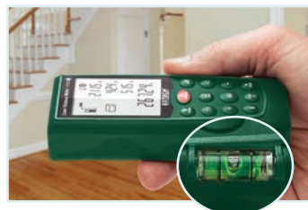
Built-in Bubble-Level for reference