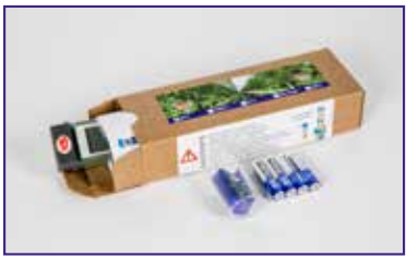
Tester kit Ecopack