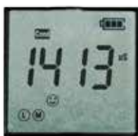
Display COND 1