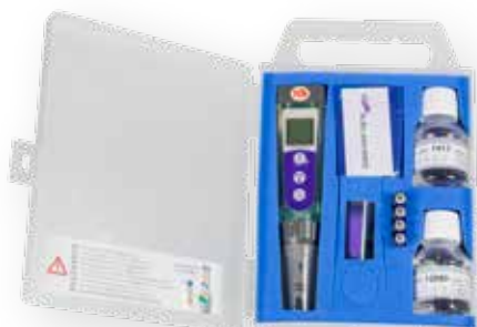
Kit COND 5