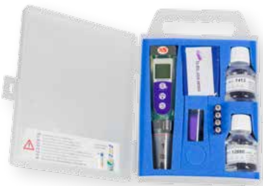
Tester kit with case