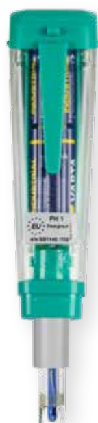
Transparent plastic body