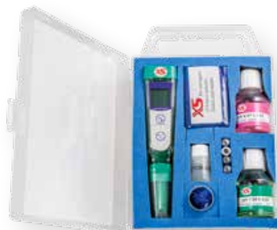
Tester kit with case