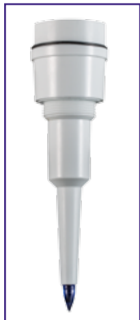
SPH 51 FOOD electrode replacement for pH 5 FOOD