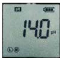
Display pH 1