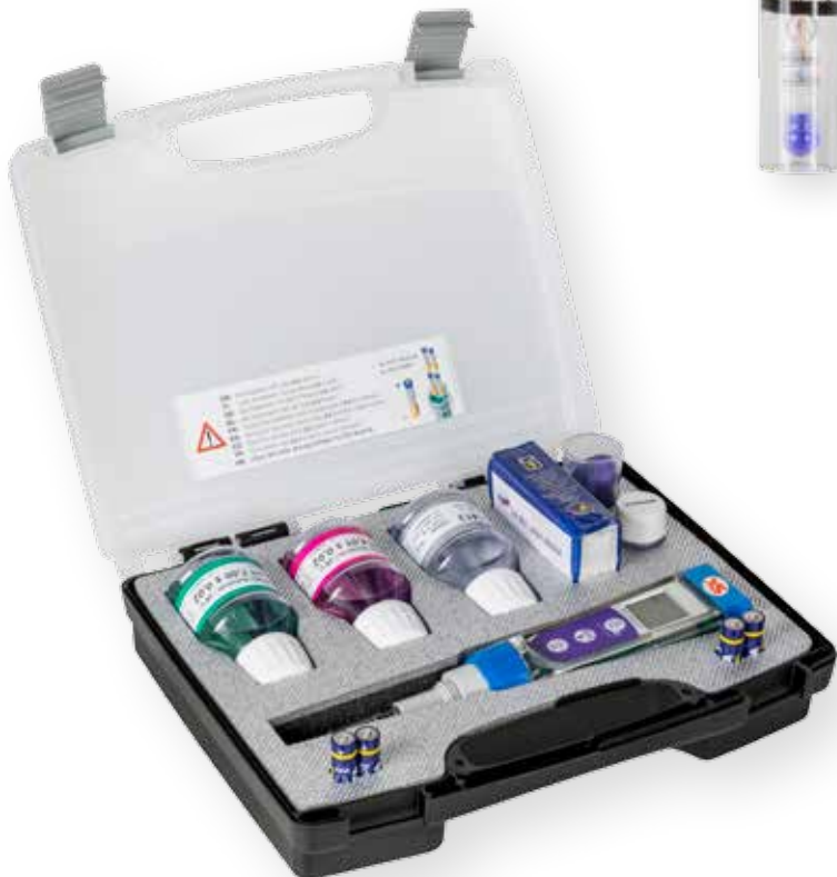
PC 5 kit with case