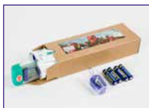
Tester kit Ecopack