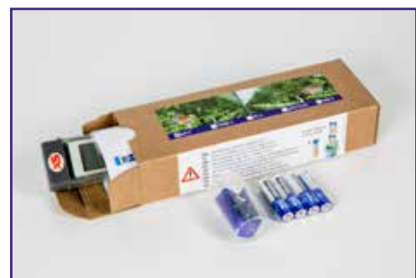
PC 5 in Ecopack