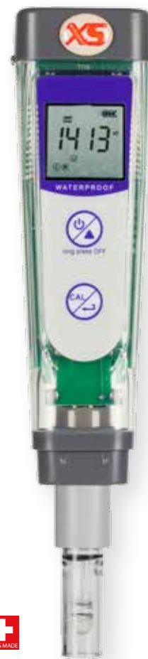
Tester COND 1