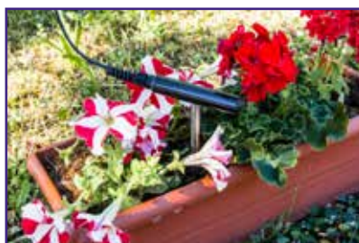
Soil conductivity with VPT Soil