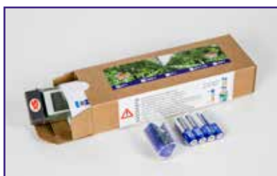
COND 5 Ecopack