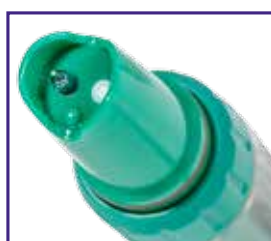
ORP 51 replacement electrode for ORP 5