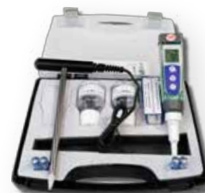
Kit with external sensor