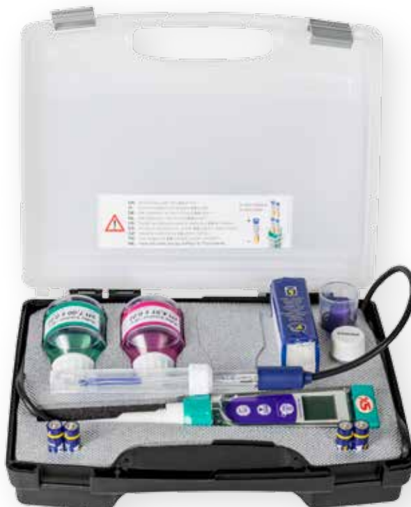
pH 5 kit with external pH electrode

A new line of pH sensors for pH 5 testers, that transforms the pH5 meter into a high-reliability portable instrument for a variety of applications.