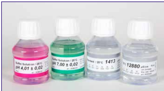
Standard calibration solutions