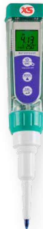
pH 5 FOOD