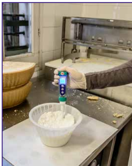
pH 5 Food