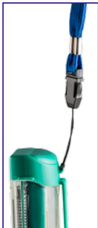
String for the neck