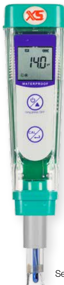
Tester pH 1