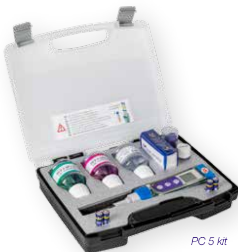
PC 5 kit