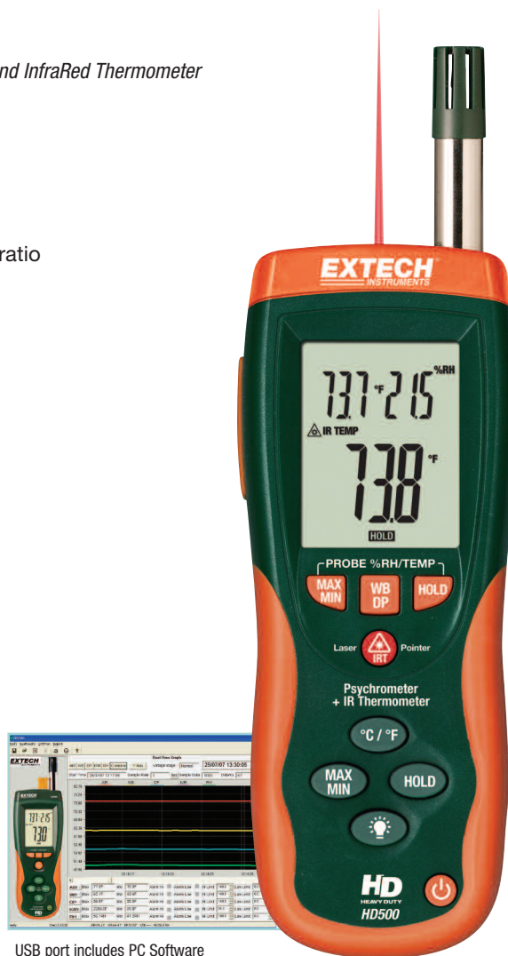
USB port includes PC Software

Patented non-contact InfraRed Thermometer technology built into a Hygro-Thermometer is perfect for Home inspection applications.