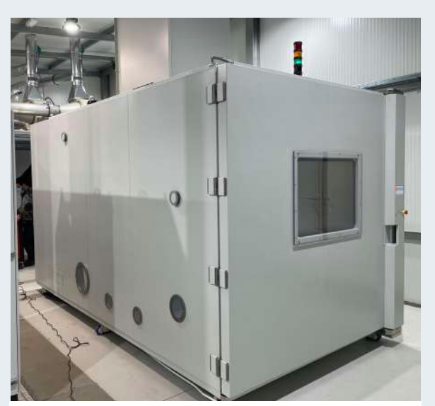
EUCAR ATEX WALK-IN CHAMBERS