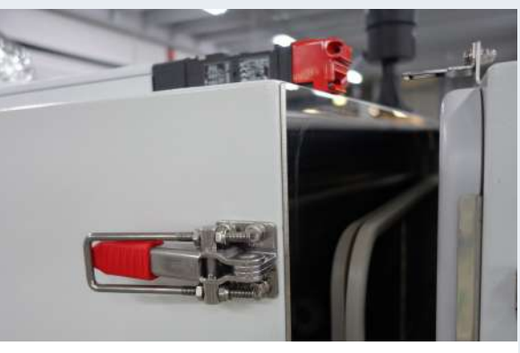
MAGNETIC DOOR LOCK AND MANUAL LATCHES