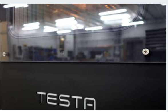
POLYCARBONATE WINDOW PROTECTION