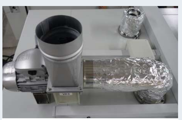
FLUSHING / PRESSURE RELIEF SAFETY