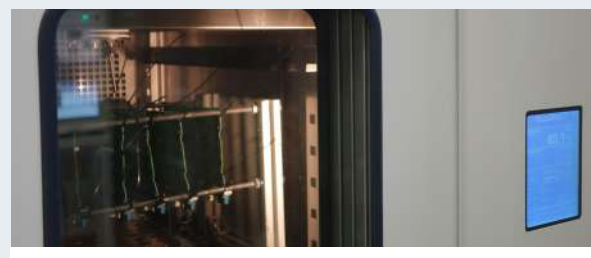
TEMPERATURE SHOCK CHAMBERS