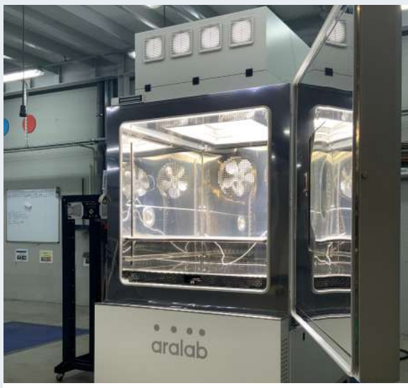
SOLAR AND UV RADIATION CHAMBER