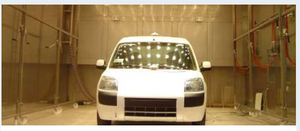
SUN SIMULATOR DRIVE-IN