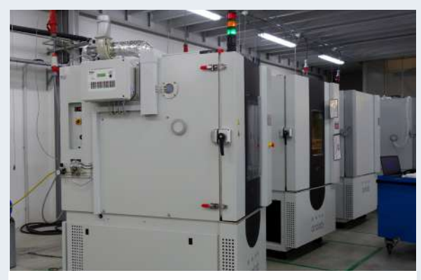
TESTA ATEX CHAMBER