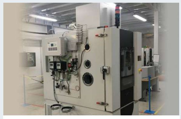
TESTA BATTERY TESTING CHAMBER