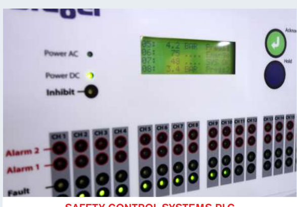
SAFETY CONTROL SYSTEMS PLC