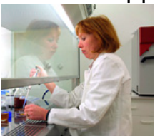
Basic Research / Research Institutes