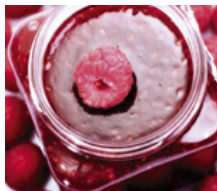
Food / Beverage