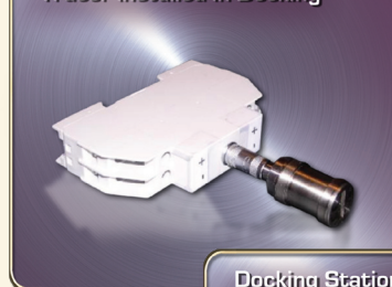
Docking Station and wire lead adapter