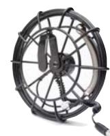
Camera probes with cable length greater than 3m will be coiled on a spool as shown on the left.