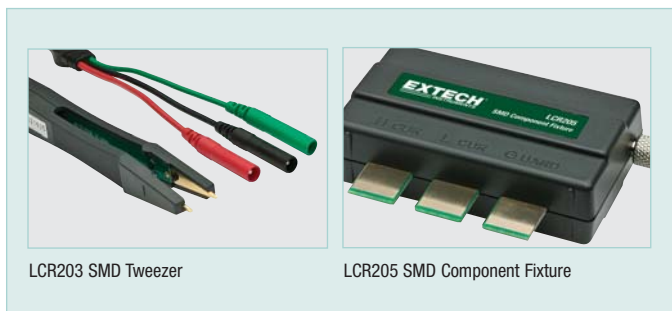
LCR203 SMD Tweezer