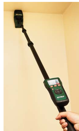
Wireless sensor affixes to telescoping handle