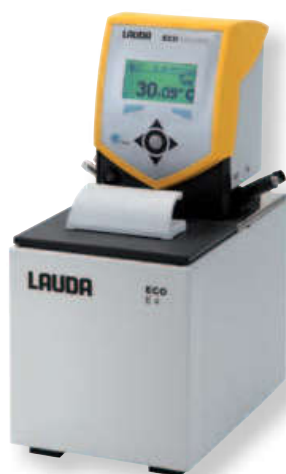
Heating thermostat E 4 S

The heating thermostats with control head Silver are suitable for a temperature range of up to 200 °C. All heating thermostats are equipped with a cooling coil as standard. The E 4 S is fitted with a bath cover and pump connections for external applications with nipples made from plastic.